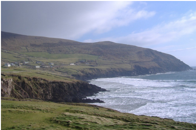
View of the famous Irish countryside.

The number of credits for each module is not equivalent to UMW credits. A 5 credit module, for example, is equivalent to 2.5 UMW credits. Normally, 15 UMW credits will be awarded for 30 UCC credits. All major courses must be pre-approved by a UMW department chair. Elective credits may be approved by the Center for International Education. Students must receive a "C" or better for courses to transfer.