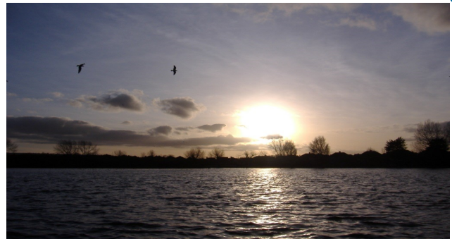
Sunset over the River Lee in Cork.