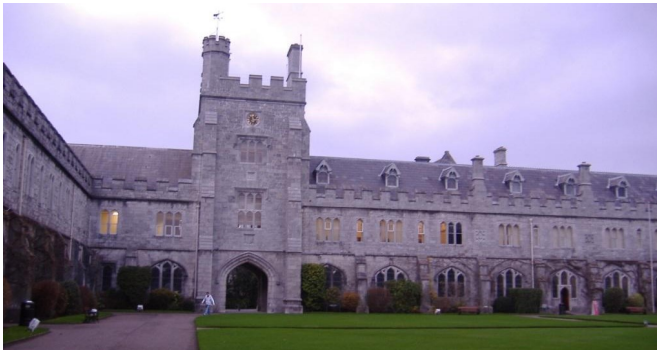
View of the University College Cork campus.

Cork is the second largest city in Ireland and is a vibrant and expanding center for culture and the arts. It is home to a number of international film, choral, and music festivals. Cork is ideally situated at the head of the inlet of Cork Harbor with the sea just to the south; mountains, hills, and river valleys to the north and east; and the well-known Lakes of Killarney to the west. Long distance walking and cycling are very popular in the region. In all, the countryside has about 1,000 kilometers of developed walking and cycling trails.