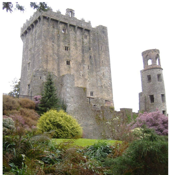
Blarney Castle in County Cork.

Participants in the UMW program are housed in one of the self-catered residence halls, a 10-minute walk from campus. Although consideration is given to each request, housing choice is not guaranteed until deposits are paid. Housing is assigned on a first-come-first-served basis. Residents are responsible for their own food purchases and preparation. Each apartment has a fully furnished kitchen and living room. A wide range of dining facilities is available to students. Students may purchase a meal plan, which offers great savings.