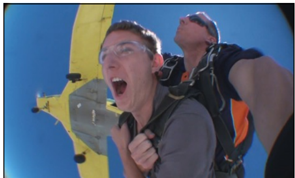
Skydiving in Cairns, a four hour drive north of Townsville.