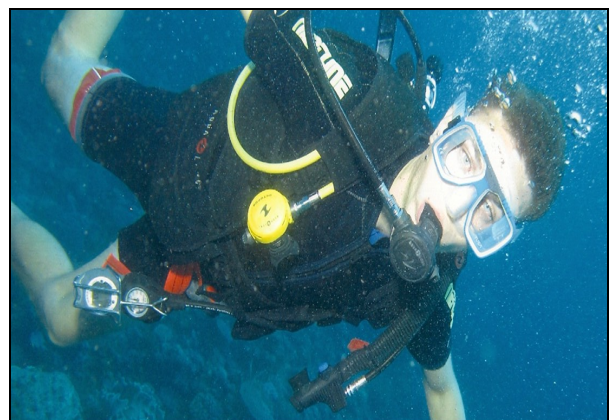
Snorkeling at the Great Barrier Reef, off the coast of Cairns.

The JCU International Student Centre (ISC) sponsors excursions on weekends. As part of Orientation Week, the ISC organizes subsidized excursions for all new students. The province of Queensland offers many leisure activities that take advantage of the environment and pleasant climate. Students may visit the Great Barrier Reef and the rainforests of Paluma, go mountain biking and bush trekking, or visit nearby island resorts by ferry. Excursions are not included in the cost of the program, but discount rates are available during student orientation.