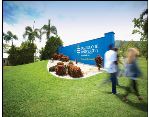
The James Cook University entrance.

Diverse environments, vibrant communities, and challenging academic programs are just a few of the reasons why so many students choose to study abroad at James Cook University. No other university offers such a wide range of classes in the shadow of two of the world's finest natural heritage areas - the Wet Tropic Rainforests and the Great Barrier Reef. JCU has an international reputation for expertise in matters relating to the tropics - marine biology, environmental studies, and tropical health - while offering courses in everything from business to indigenous Australian studies. Small classes, accessible teaching staff, and effective support services give students the personal attention they need. For more information, visit www.jcu.edu.au/international .